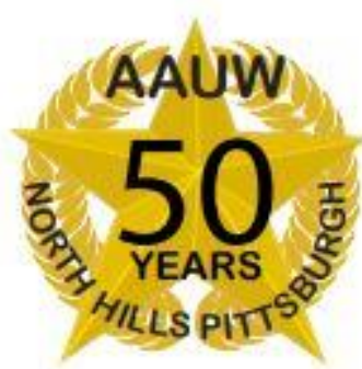
Anniversary Pin Design