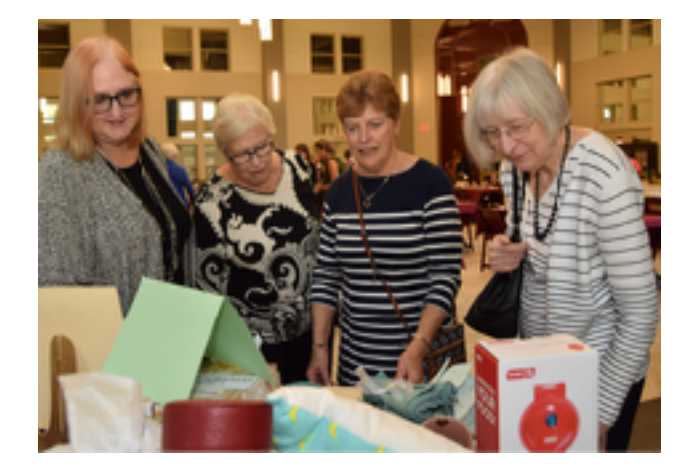
For the love of books Meet the Authors at Tea