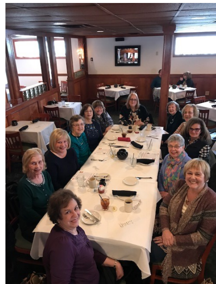
Lunch Bunch - January 23 Good food and conversation at the 9101 Bistro,