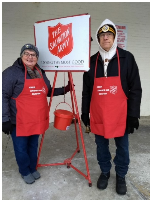
Ringling bells for Salvation Army