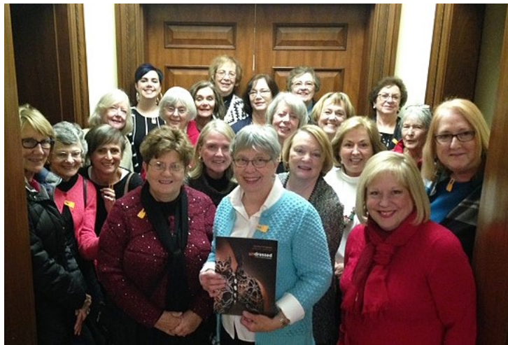
Undressed Exhibit at The Frick