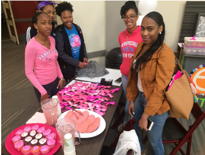
AAUW Students running a Breast Cancer Awareness table