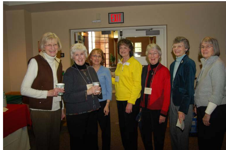
Members enjoying the February Meeting