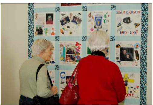
Viewing the Memorial Quilts The Caring Place