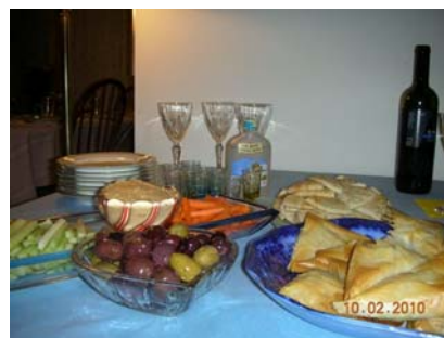
Olives, Hummus, & Tiropites And Ouzo