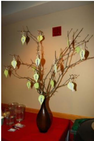
Our Genealogy Tree