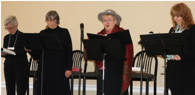
The Marion Talbot Story Reader's Theater

Want to learn more about AAUW-PA and have lots of fun. Why not consider attending the 88th annual meeting, April 21-23, 2017, at Heritage Hills Golf Resort in York?