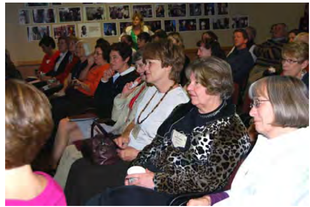
Members and Guests