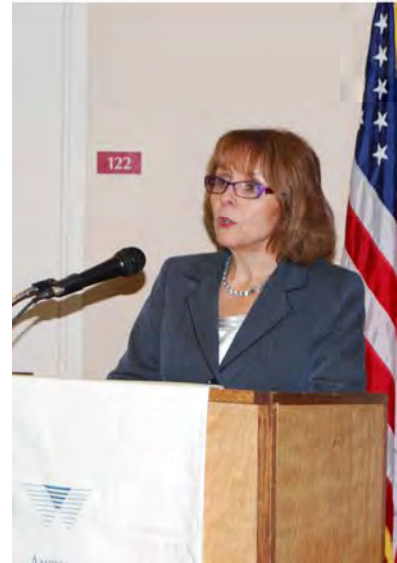
A Representative from Zonta