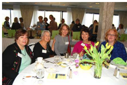
Members enjoying luncheon

Our guests at the Luncheon on the 26th from the North Hills Art Center brought and displayed pieces which were very interesting. Good conversation happened around the display area. The North Hills Art Center schedule of classes can be found at www.northhillsartcenter.com . Check out their offerings.