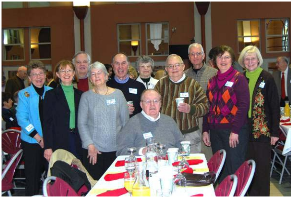
Martin Luther King, Jr. Unity Breakfast Attendees, January 17, 2011