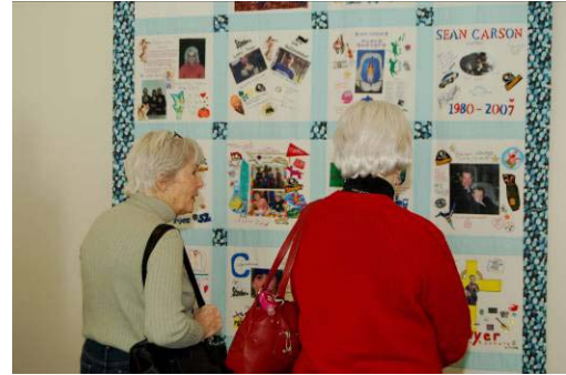
Viewing the Memorial Quilts The Caring Place