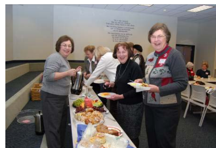
Our Members enjoying treats at The Caring Place January 22, 2011