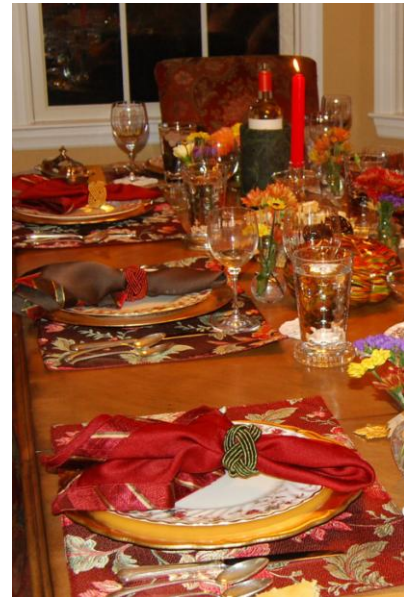
What a pretty table setting at Clare Hokes's for the Chilean International Dinner,

CD: $3700.27 at .3% matures on 9/26/2014