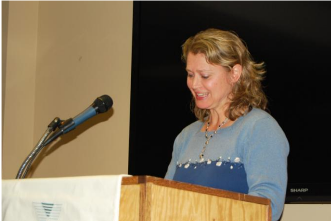
Guest speaker from Dress for Success